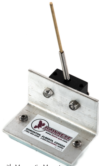
Pneumatic Level Switch with Magnetic Mount.