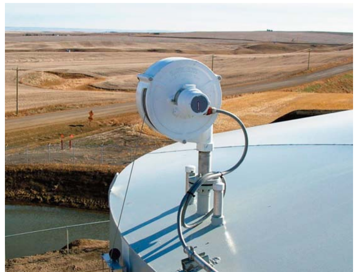
Below: Redtail with Optional Goshawk Transmitter installed on a tank.