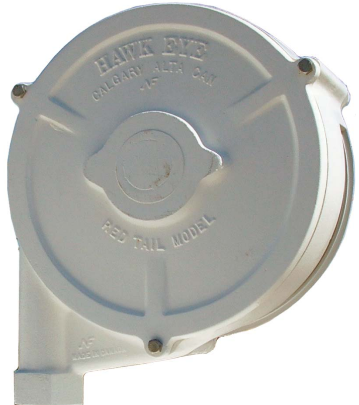
Above: Redtail Hawk Gauge Head