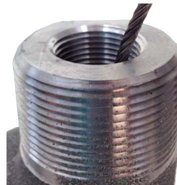
Dual 1-1/2 M-NPT and 3/4 F-NPT Mounting Options (left)