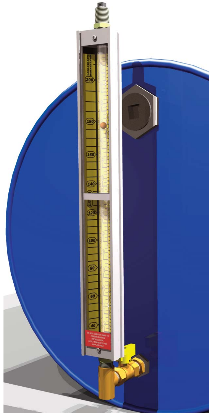
Above: Cooper's Hawk Barrel Gauge installed on the 3/4 NPT bung of a 55 gal drum, with metering valve.